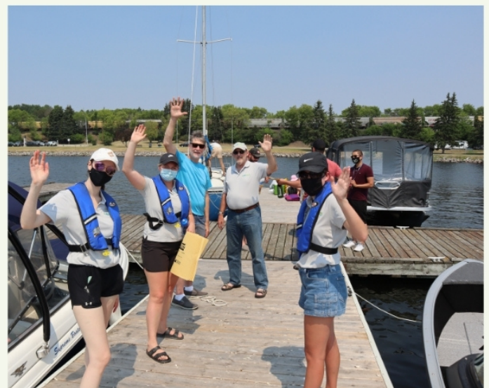
size of logo, frequency of mentions & shoutouts, and personalization of posts are based on sponsorship level